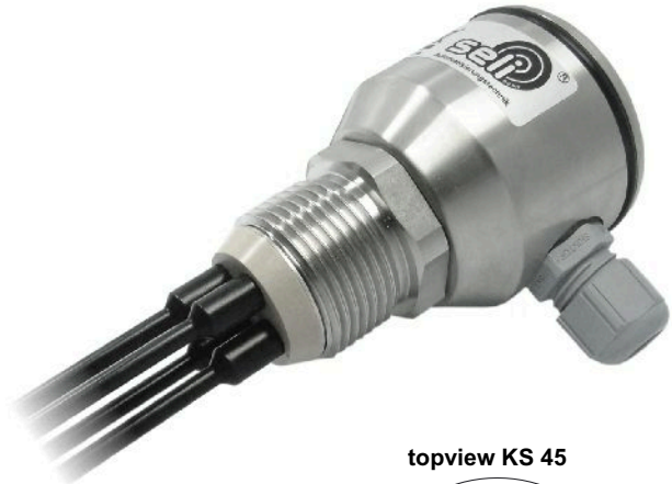
topview KS 45