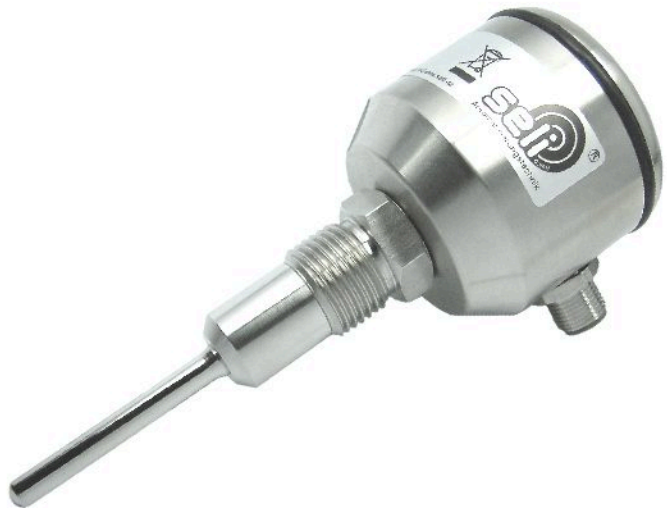
With measuring transducer MUK Without measuring transducer MUK